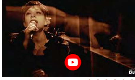
The time of the crows